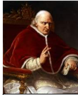
Castiglioni (Pope Pius VIII)