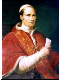
Della Genga (Pope Leo XII)

Now if you had told any of those pew sitters back in 1770 that they had two future-Popes in the back of their church, they'd have laughed you out of the building: "Those two boys? The ones shoving and whacking each other with candlesticks?".